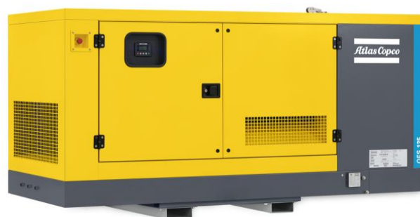
Genset Image for illustration purposes only